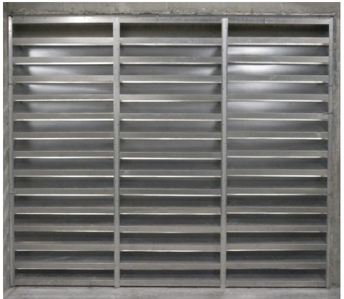
Test specimen installed (as tested)

Additional test specimen information is provided on page 2 (drawing provided by client).